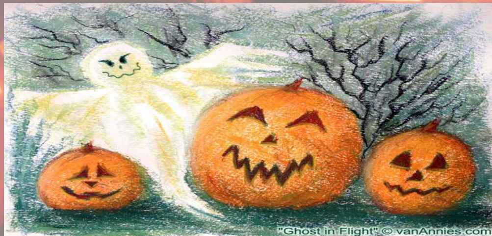
"Ghost in Flight"